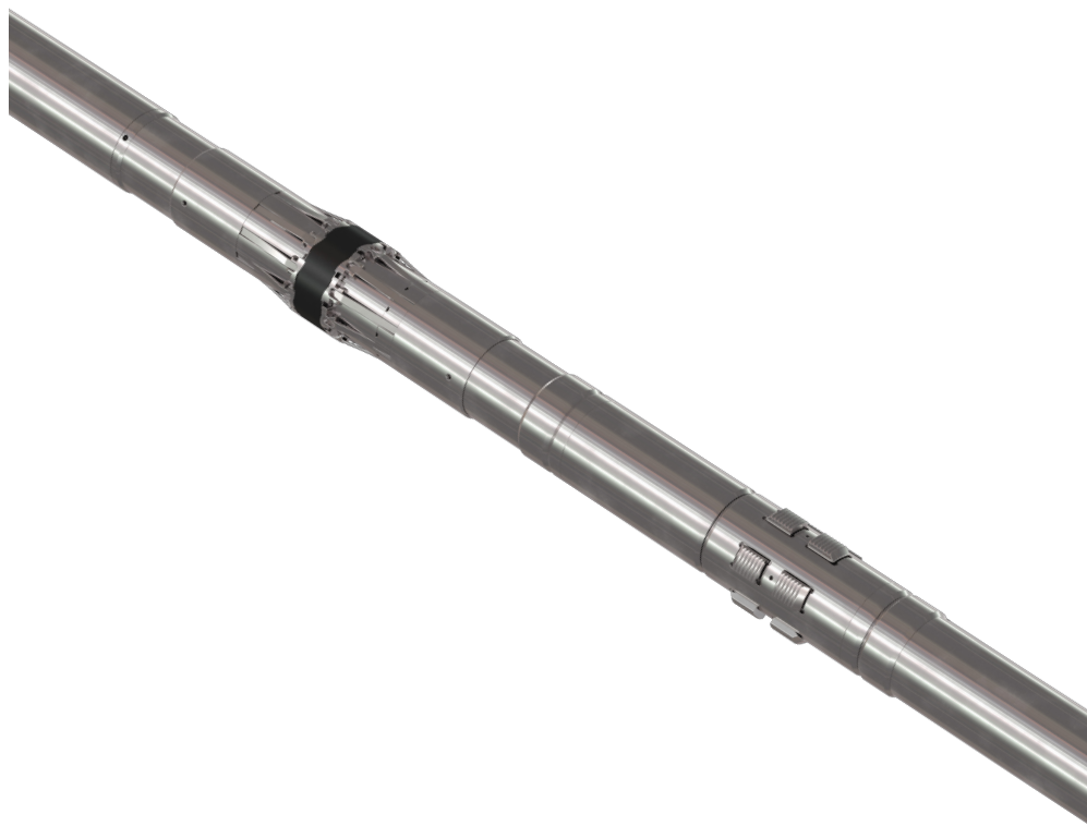
Multi-Run Anchored Production Straddle (APS).

The APS was mobilised to the location within two weeks - enabling the operation to be completed within three weeks from when the plan was established. This enabled the client to significantly reduce production downtime and quickly switch the well back online. In avoiding a workover, the solution saved our client considerable time, cost and helped reduce emissions.